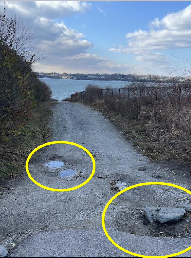
Y-1 Before December 2024