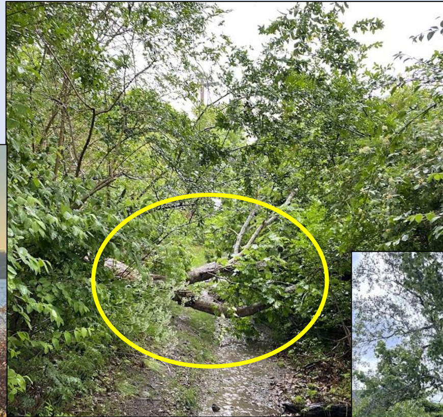
Y-11 Before May 2025