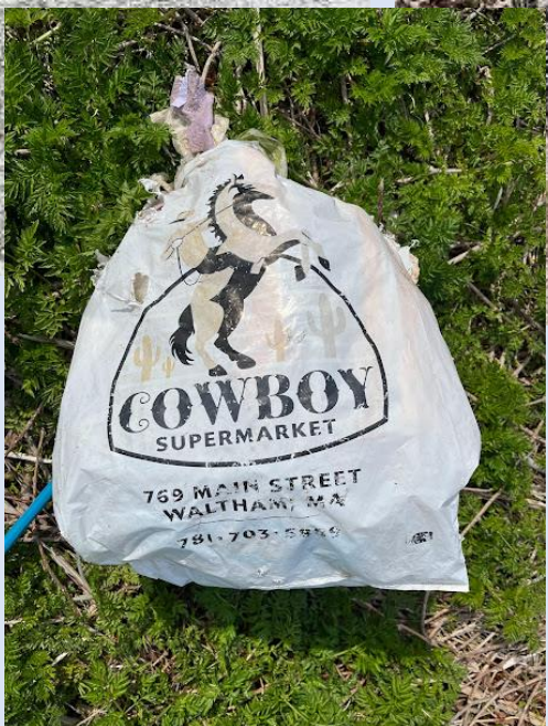
Y-7 Pebble Beach Kingfisher Avenue